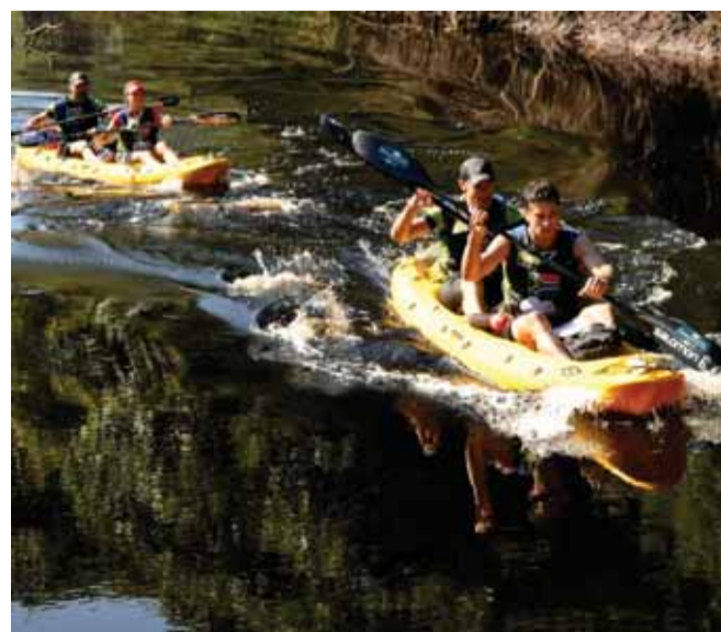
Below:- Team Featherbed coming in first to Transition 3 at Black Waters River Lodge on Day 1. They have maintained their lead since then, but news of missing a checkpoint may have scuppered their chances of winning.... unless they manage to get back to it!