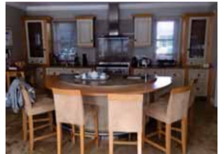
Custom kitchens and furniture