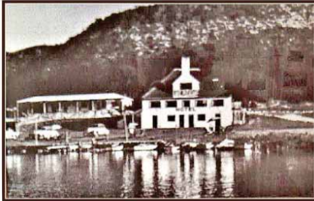
Lake Pleasant Hotel in days of old.