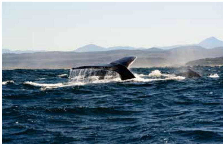
Mating whales on the move:- Picture kindly supplied by Lisa Leslie Photography - www.lisalesliephotography.com.

Dolphins and whales in the Western Cape remain relatively understudied, mainly due to the large and fairly isolated coastline and few numbers of researchers.