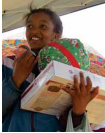
This young SwopShopper was rewarded for diligence having attended more than 25 SwopShop days in 2015

FreshStart Sedgefield is committed to helping children help themselves to a new start. Their first project, the Smutsville Recycle SwopShop has been going for two years.