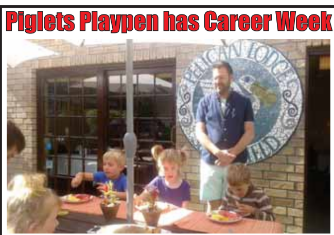
by Melanie Baumeister

Lovable 2 year old male, pure bred Staffie looking for a good home. Loves people, children &