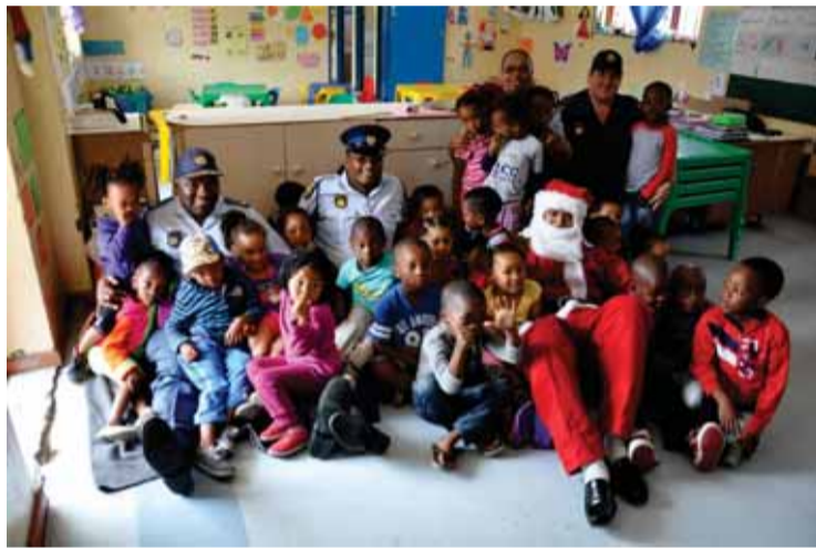
SAPS Members relaxing with the Rainbow Crèche children

As part of the 16 Days Against Violence Towards Women and Children Campaign, the Acting Station Commander,