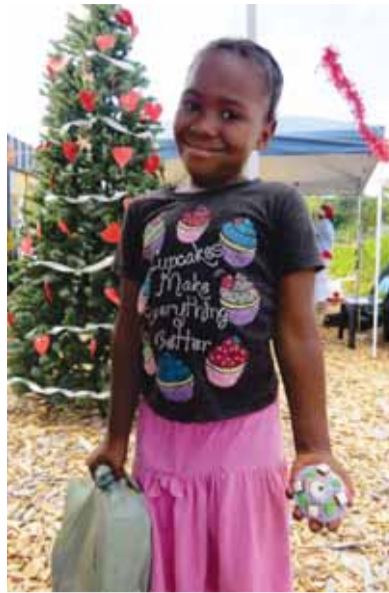
Christmas Trees Cupcakes and a packet full of goodies brought lots of smiles

The SwopShop shelves are continuously filled with