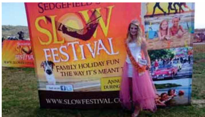
Miss SlowFest 2015

With sponsorship of three amazing prizes, the organisers hope to incentivize individuals, groups, families, corporates, charities or groups of friends to come up with best parade creation.