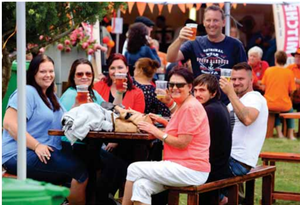
Cheers to the Village Green

During Sedgfield's Slow Festival, the Village Green forms the central axis around which everything turns.