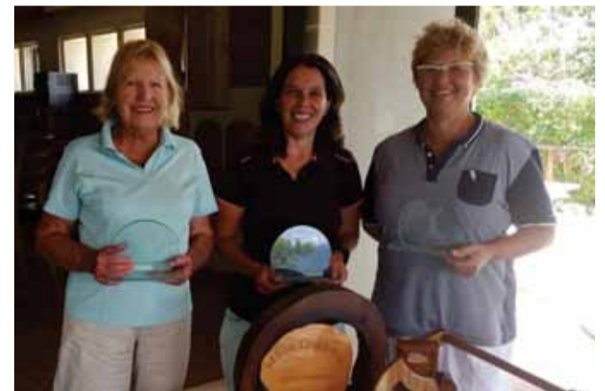
Winners of the Links Ladies' Championships