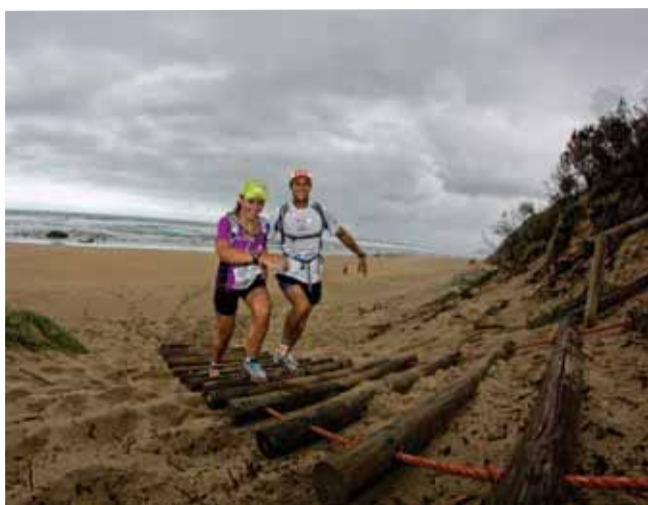
The Tortoise Tuff's 21.1km trail run includes sections along the beach, through the Goukamma Nature Reserve, and some challenging dune climbs.

This drive, inspired by the soon-to-be-launched Smutsville Time trials - a sport development initiative of the Striders, is aimed at providing 2nd hand training shoes for young athletes who cannot afford to buy new ones.