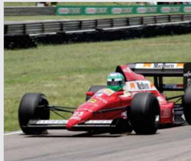
First-ever Formula 1 car to tackle the Simola Hill

Visitors to this year's Jaguar Simola Hillclimb, taking place in Knysna from 6-8 May 2016, are in for a real treat, with the most exciting programme and the most expansive and exotic line-up of cars yet in the award-winning event's history.