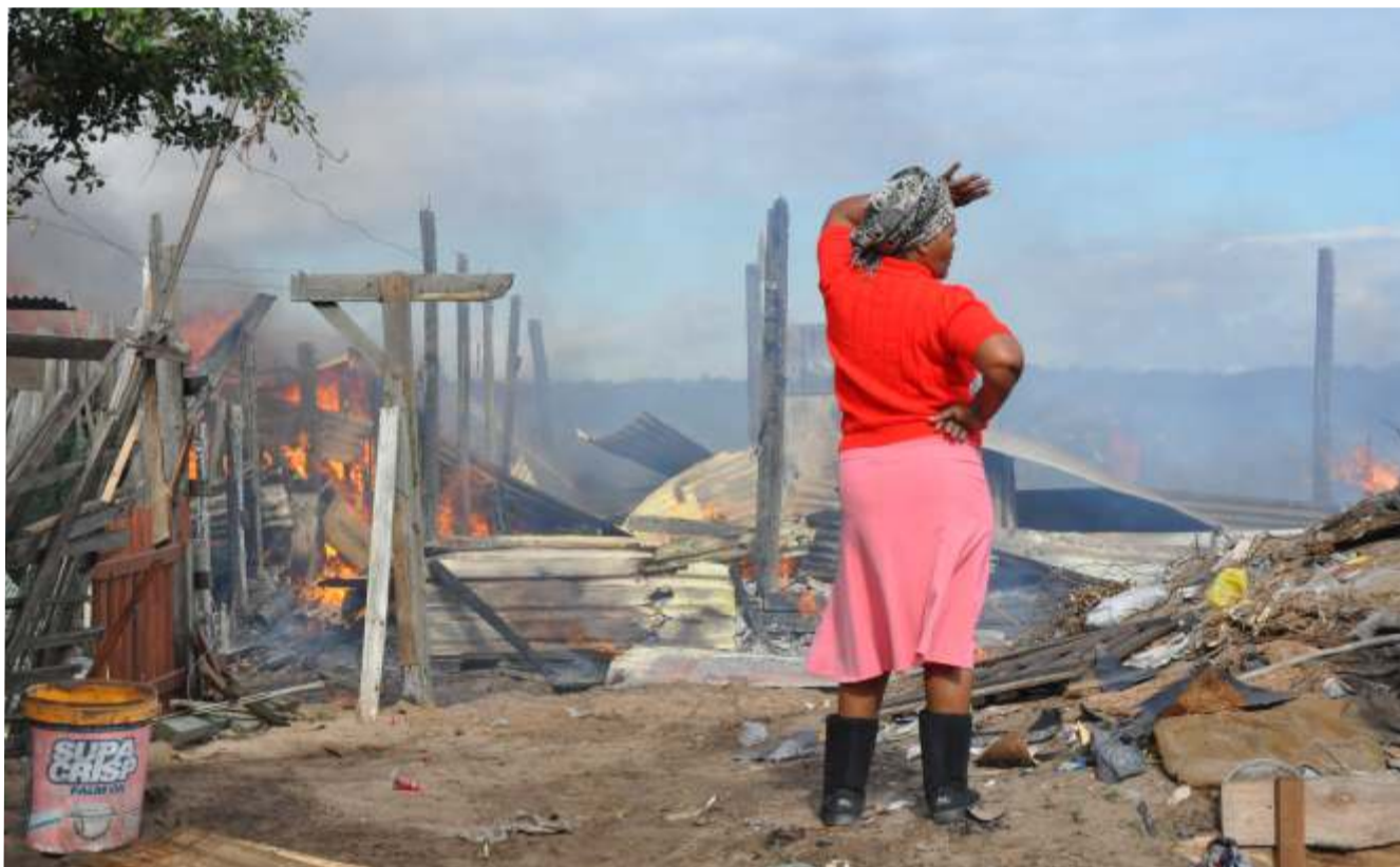
A resident looks on in dismay whilst flames leave a path of destruction in the Beverly Hills community..

Sedgefield's residents went into shock on Friday 22 July when an horrific fire gutted numerous homes in the Beverly Hills neighbourhood of Smutsville, Sedgefield. With the wind working against fire fighters, municipal staff and residents trying to assist them the blaze could not be extinguished before 17 family homes had been destroyed, affecting 58 people including 22 children. A further five homes were partly damaged.