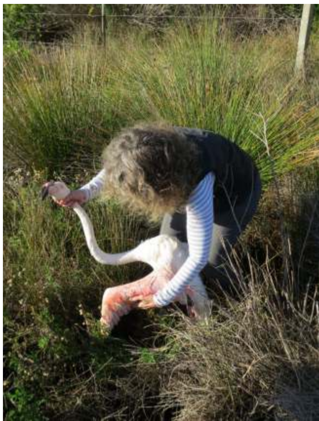
Tenikwa staff member carefully removing an injured flamingo.