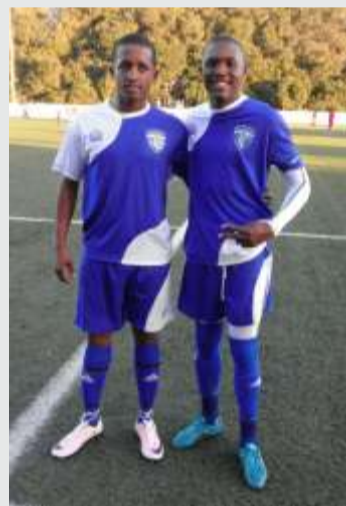
The Slow Town Football Club want to say a big thank you to Cool Care for their sponsored soccer jerseys.