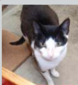
Matilda (above) is a gorgeous black & white female cat born JUN 2011. She will be the perfect companion!