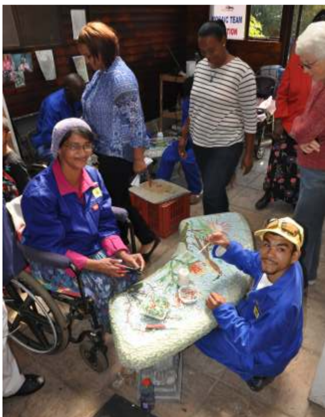
A tour of the mosaic project was part of the Masithandane open day.