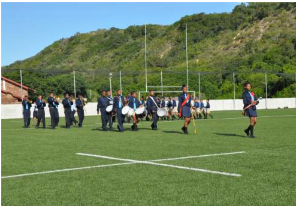
Sedgefield's Church of the Resurrection brigade in action.

When marching brigades from Plett to Swellendam arrived in Smutsville on Sunday 2 October, anyone would have been forgiven for thinking there had been a military invasion!