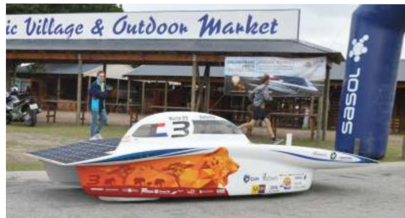
Team Nuon from The Netherlands was one of the first to arrive in Sedgfield.

crew had been very impressed with the stop off point in Sedgfield, particularly the support from locals watching them come in, and the general