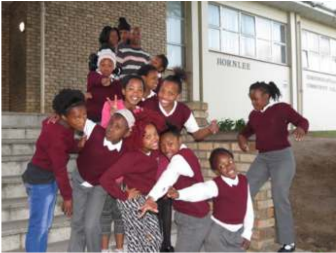
It was evident that this Talent Show provided great entertainment to all. Singers from Sedgfield excitedly waiting to sing.