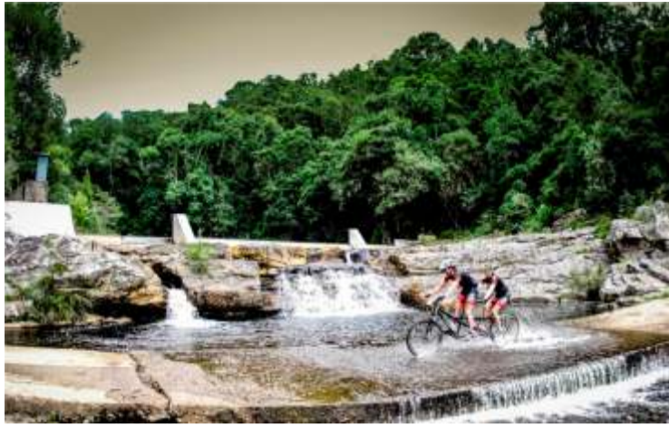
TransCape participants traverse some of the most scenic and rugged mountain biking terrain in South Africa.

The seven-day event across the width of the Western Cape will be added to the company's repertoire of partnership events, which include flagship races such as the Bestmed Tour of Good Hope, Liberty Encounter Series and Sanlam MTB Invitational.