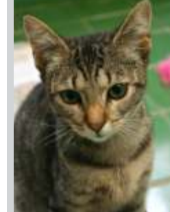
Silver (above) is a beautiful female tabby cat born OCT 2015. She promises unconditional love, cuddles and

Knysna Animal Welfare Society has a cattery full of gorgeous cats and kittens, and a wonderful selection of dogs of all shapes and sizes, all ready to move into your home and into your heart. You can see the full selection on www.knysnaaws.com or visit the kennels at 1 Marlin Street, Hunters Home, Knysna to select your new furry friend.