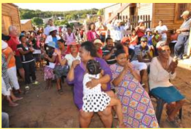
Operating Threat is sorted out...."

"It is heart-warming to see the spirit of ubuntu within the Sedgfield community. Shortly after the news of the fire broke, people of this community lent a helping hand by donating necessary items. I would like to express my sincere gratitude to each of you for showing your support to the affected families and acting as a go-between for the community and donors."