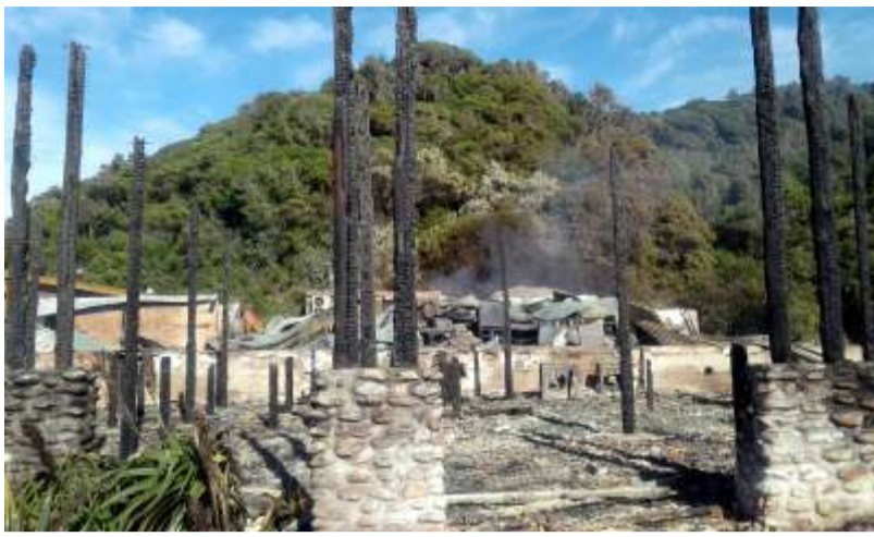
Fire completely guts Storms River Cattle Baron Restaurant & Shop

On Friday 25 November, just a week or two prior to the start of the peak tourist season, a fire left the Tsitsikamma Cattle Baron restaurant at Storms River Mouth and the adjoining shop in a smouldering heap of ashes.