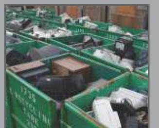
E-Waste facility at the Knysna refuse transfer station located at the bottom of Queen Street, behind the Knysna Municipal Fire Station, is operational on weekdays.

Follow us on Facebook /knysnamunicipality