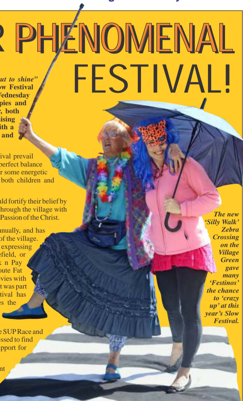
The new 'Silly Walk' Zebra Crossing on the Village Green gave many 'Festinos' the chance to 'crazy up' at this year's Slow Festival.