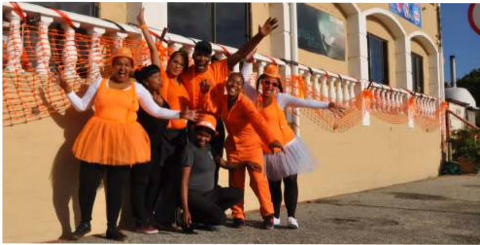
The Pili Pili Team made the 'Getting Orange' concept come alive over the Easter weekend.

Sincere thanks must go to all the businesses who took part in the 2017 EDGE GET ORANGE Competition, the town certainly came alive with decor in time for the Sedgefield Slow Festival.