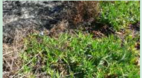
Carpobrotus edulis defied the hot fires which surrounded it near Groenvlei.

It is important to remember that these plants will inhibit the progress of ground fires but can do little to slow down fires where there is thick and tall overgrowth.