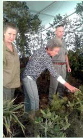
The Enchanted Forest

It was estimated that about 3 000 elephants once roamed the Cape Floristic Region in pre-colonial times, of which about 1 000 occupied the Outeniqua-Tsitsikamma area. In the late 1800s between 400 and 500 elephants remained and by 1900, only 30 to 50 elephants were left in the Knysna area. This small population dwindled even further and recent attempts to determine the elephant population status included a genetic study, photographic identification, surveys and sightings, with varying results, ranging between one and five elephants.