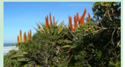
Aloe ferox in its full glory at Cannon Rocks, East Cape.

Cycads are also very resilient and after burning cut off all the leaves and the plants will put out fresh shoots again. Fires are part of a number of cycad species' growth cycle and many specimens can be seen in the wild with burnt stems. Diets (Wild Iris) commonly used for roadside plantings may burn right down to the ground but will soon recover after the good rains which all of us are waiting for.