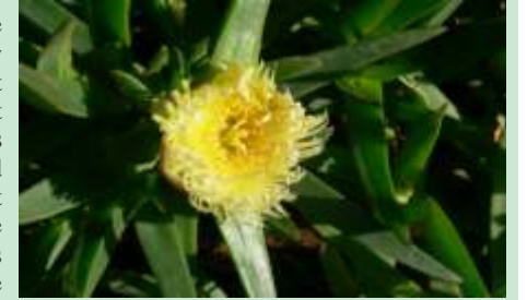
Carpobrotus edulis in flower in burnt area outside Sedgefield.

Looking at the damage caused by the Knysna fires it would appear that many of the plants are beyond recovery and that they should be removed. This is not always the case. Strelitzia Nicolai (Wild Banana) is very resilient. The badly - burnt leaves and charred stems should be removed and the plant will once again shoot out from the ground. The same applies to the indigenous Strelitzia reginae (Crane Flower) which soon pops up again. Our indigenous palm, Phoenix reclinata may have badly burnt stems but after good rains new leaves will again appear at the top of their tall stems. Most deciduous trees can recover but conifers seldom recover and will remain or become unsightly.