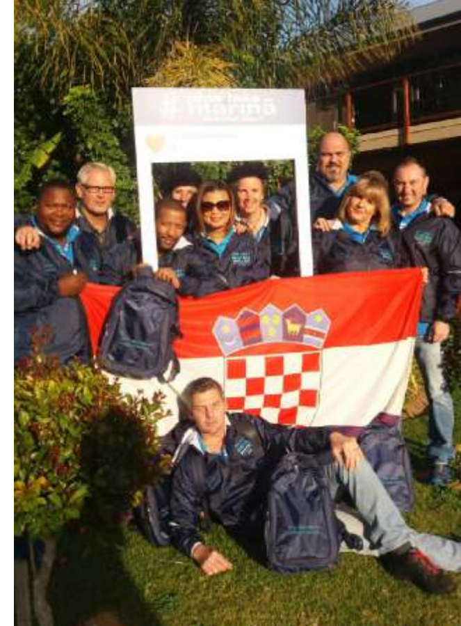
'In August 2017, two groups of Pine Lake Marina's Team Leaders are going to be treated to some training and some holidaying in Croatia on The Island Vis. As part of their work experience they are in the very unique situation of creating memories - firstly as the employees of Pine Lake Marina and then as guests themselves.

This is exactly what the resort of Pine Lake Marina aims to do for their own guests, they create memories. The groups are very grateful for the opportunity and are looking forward to sharing the experience with each other and coming back with information that they can use in their day to day working environment.