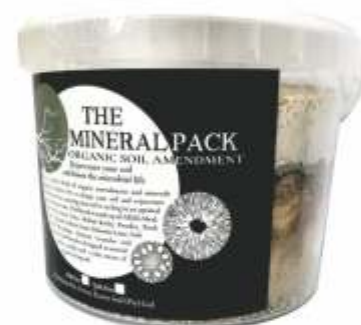
The Mineral Pack

If you are looking for something but do not want to come into the shop, we will gladly get your order ready for collection