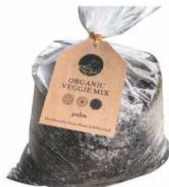
Organic Veggie Mix

Organic Lucerne Bales • Organic Horse Manure Premium Compost • Organic Veggie Mix Mineral Packs • Organic Nutrients Organic Amendments & Minerals Organic Pesticides