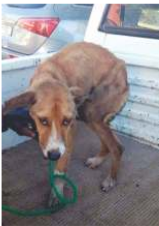
Toby before and after

So you see, it's not all doom and gloom. Stay positive, get plenty of fresh air, sunshine and exercise (take your dog with you). Until next time,