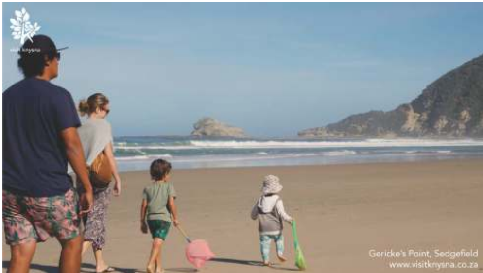
Gericke's Point, Sedgefield