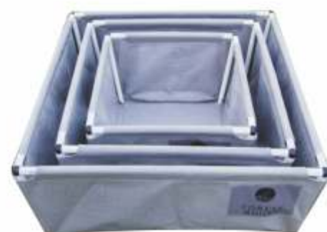
Fabric Raised Beds