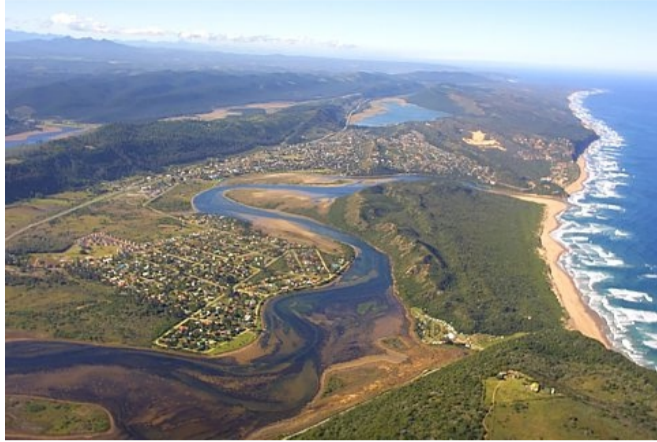
A bird's-eye view of the Swartvlei wetland.

“The Southern Cape and the Garden Route are home to some of South Africa’s most spectacular wetland systems, and they play a key role in the survival of critically endangered biodiversity throughout the region. However, the region is subjected to industrial-scale agriculture and unprecedented development and infrastructure,” says Cobus Meiring of the Garden Route Environmental Forum (GREF).