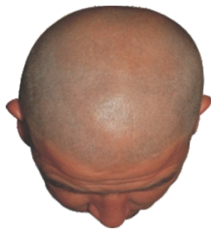
Big-Daddy Umkulu Kool Big Babu Grandalf

Why is this important? (I'm surprised you have to ask, but there you go, there's just no getting some people, is there?)