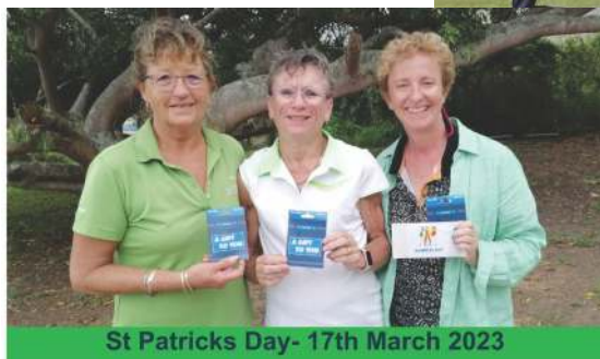
St Patricks Day- 17th March 2023

Sedge Links Ladies Division Sponsored by