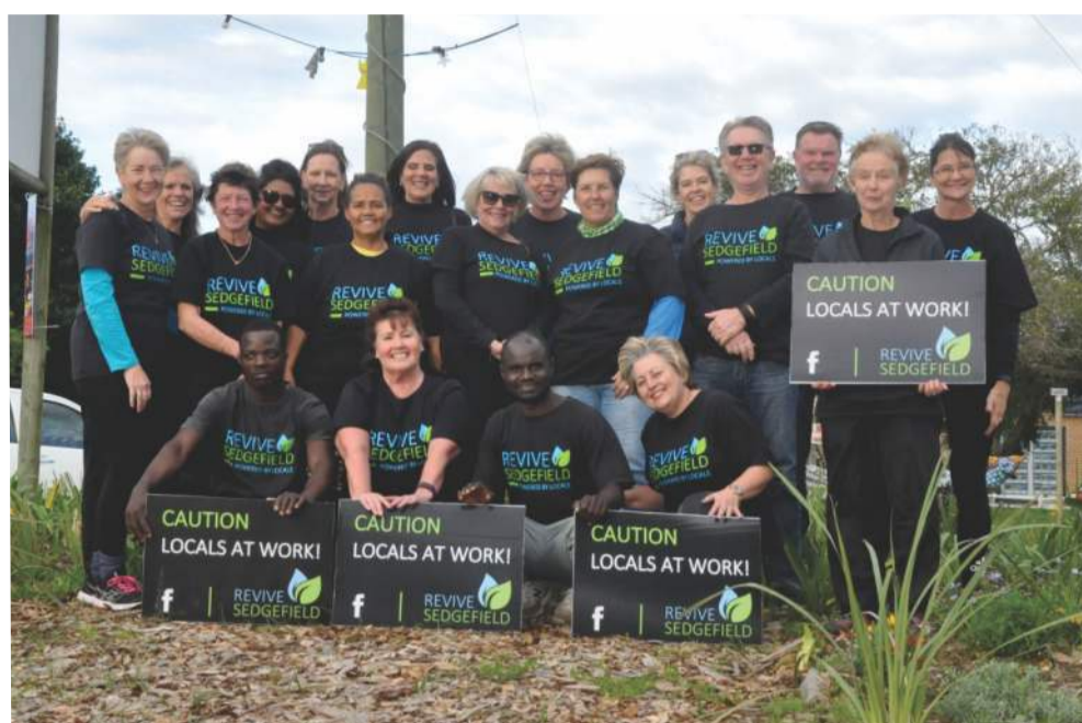
The Revive Team who are working their magic around Sedgefield.

keep an eye out for them in and around Sedgefield and show your support with a hoot or wave when you do. CONGRATULATIONS, Revive Sedgefield, for reaching your 1st birthday and reclaiming the streets of Sedgefield!