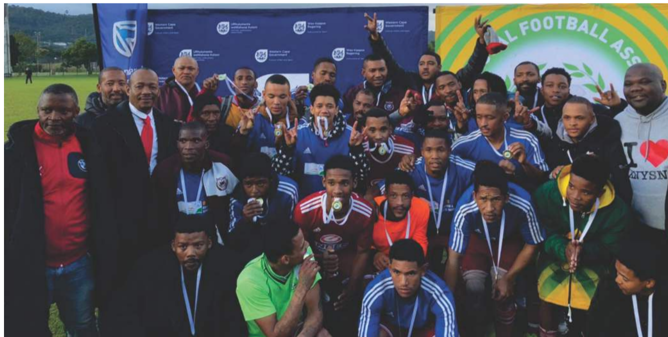
Smuts United FC - Winners of the Oyster Cup for the second year running - celebrate their victory on Sunday.

The last weekend of the Knysna Oyster Festival saw a triple whammy for Sedgefield, with three big sporting tournament trophies coming this way. Congratulations to the ladies from Atlantic Spurs (pictured top), the gents from Smuts United (pictured above) and the lads from Young Boys FC (see story on back page) for their respective victories in the Netball and Soccer competitions.