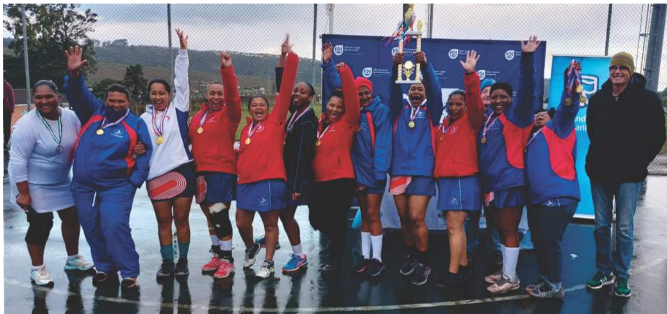
Sedgefield's Atlantic Spurs were the ecstatic winners of the Knysna Oyster Festival Netball Tournament.