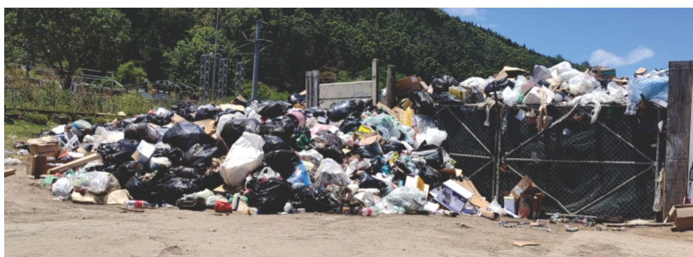
Sedgefield's noxious 'welcome mat' greets motorists coming from the west. Picture taken 9/1/2024

Whilst it seems the December/January holidays have seen a welcome influx of visitors coming to spend time in the country's favourite 'Slow town', with many businesses reporting a bumper season and traffic to the Saturday markets queuing right back into the village, there have been service provision failures that could well have resulted in disaster, never mind a besmirched name for Sedgefield as a tourist destination.