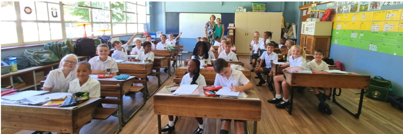
(Below) The Grade One class of Laerskool Sedgefield Primary all seem eager to start their learning day. Only 12 years to go!