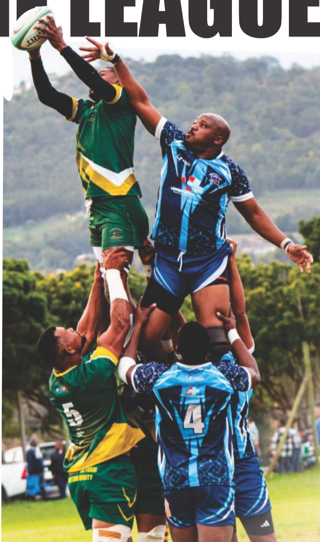
Rising above the competition, the Pick n Pay Eagle Stars winning a line-out against derby rivals Knysna United.