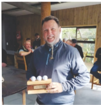
Montecello, Humble Crumble, Daily Grind, Flat Lizard, Deo Gratia and last but not least The Little Wood Shop for our lovely trophy.