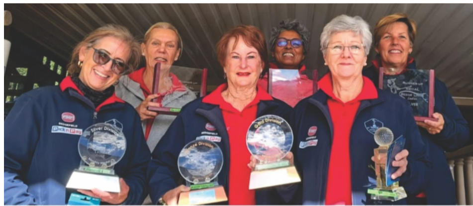
Sedge Links Ladies Division Sponsored by