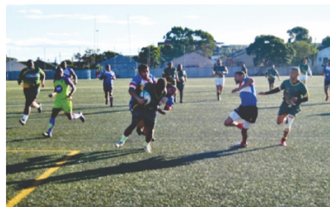
PNP Sedgefield Eagle Stars on their way to the try line