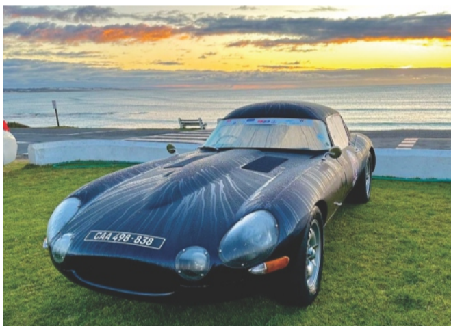
E-Type Jaguar low drag

The second Eden Classic Car and Motorcycle Show promises to be one of the best shows of its type to be staged in South Africa this year, judging by the quality of cars to be displayed. The show takes place on Sunday, 6 July, at the Scarab Arts and Crafts Village, alongside the N2 freeway in Sedgfield.