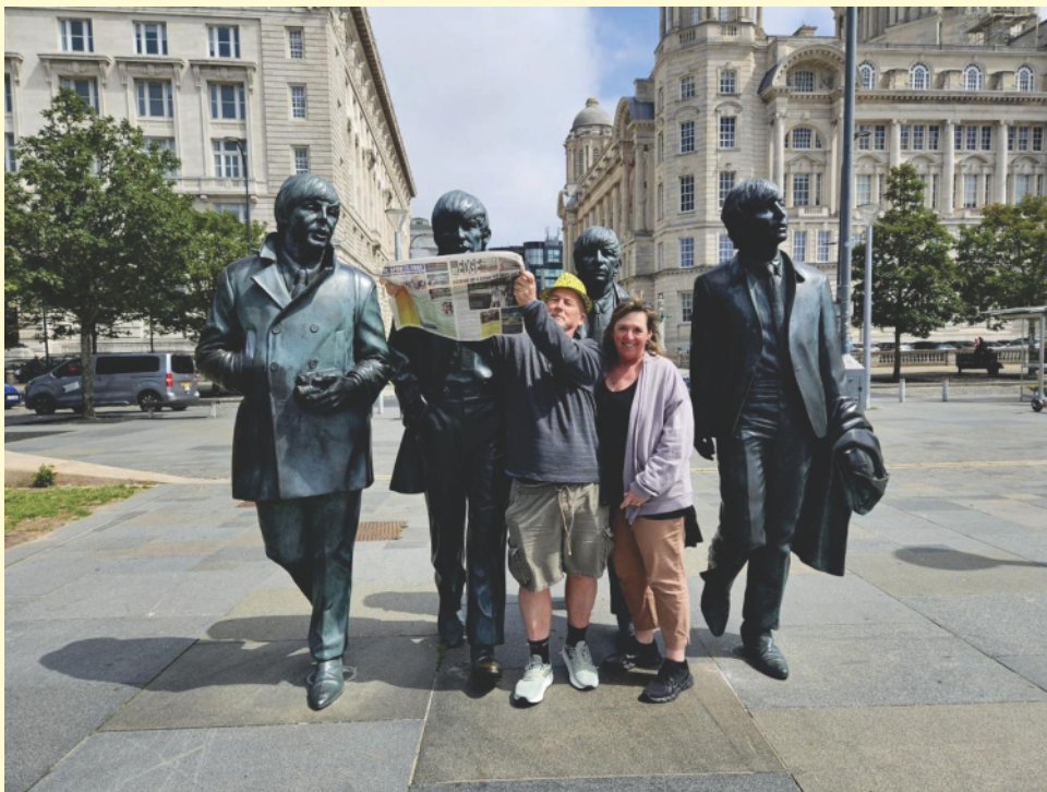
Bomber and Kel sharing local news with the Fab Four in Liverpool