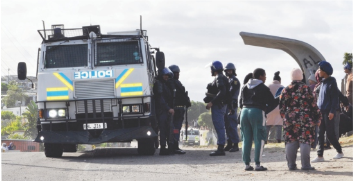
Residents and anti-riot POP members sharing Smutsville streets

2026/2027 financial year: R16,56M servicing of 207 sites