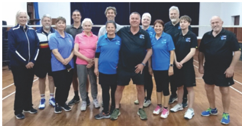
L: Sedgefield Pluimbalkklub R: Mosselbaai Pluimbalkklub

Ons is opreg dankbaar teenoor die Voorsisters van Sedgefield